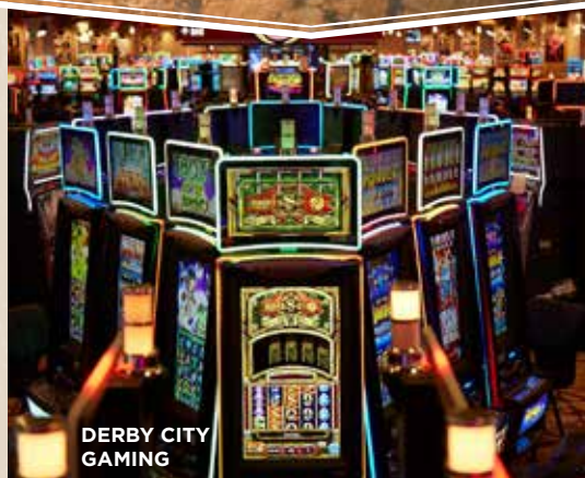
DERBY CITY GAMING

Completed in 1816, Farmington Historic Home was the center of a thriving 550-acre hemp plantation that