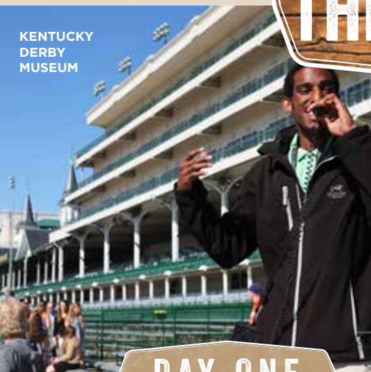
KENTUCKY DERBY MUSEUM