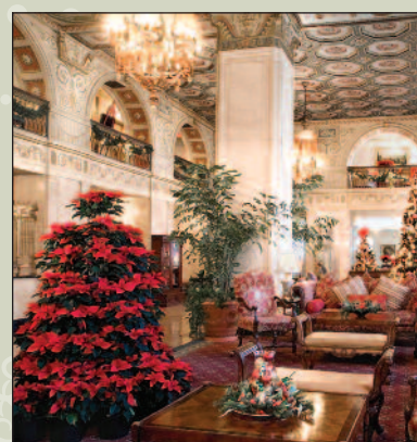
The Brown Hotel Lobby, Louisville, KY