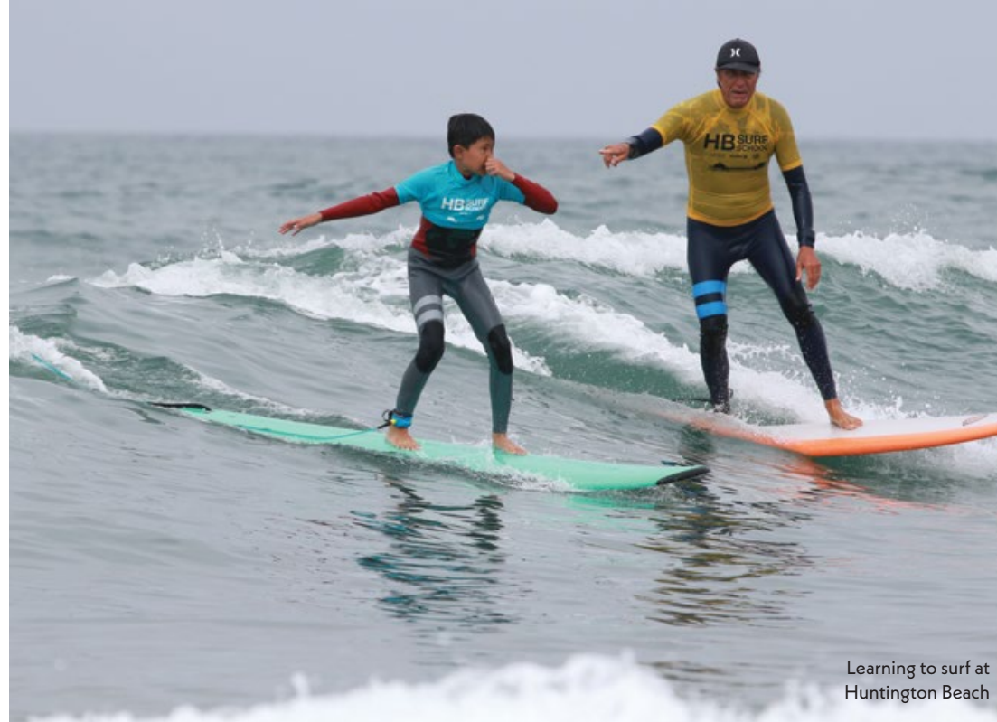
Learning to surf at Huntington Beach