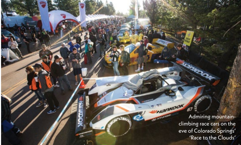
Admiring mountain-climbing race cars on the eve of Colorado Springs' 'Race to the Clouds'

Since 1916, car drivers and motorcyclists have been racing to the 14,115ft summit of Pikes Peak in the Broadmoor Pikes Peak International Hill Climb 'Race to the Clouds.' Over the years, the winning times for the 12.5 mile race, with its 156 turns, have dropped dramatically – in 2018, a sleek, electric-powered Volkswagen took less than eight minutes! If in town the weekend of the race (June 30, 2019), join the Fan Fest revellers, stunt riders and souped-up cars on the streets of Colorado Springs or, if there in August, enjoy the Pikes Peak Ascent & Marathon or the Pikes Peak Cycling Hill Climb. Throughout the year, drop by the array of race cars at the free Penrose Heritage Museum, next to the majestic Broadmoor Hotel, and, if weather permits, drive yourself up the scenically-spectacular toll road. Broadmoor Pikes Peak International Hill Climb: ( www.ppihc.org ); Penrose Heritage Museum: www.elpomar.org ; www.VisitCOS.com ❖