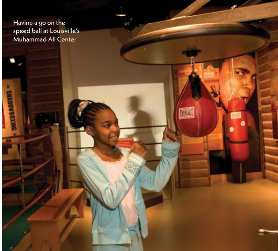
Having a go on the speed ball at Louisville's Muhammad Ali Center

Anyone who travels by air should go to this atmospheric Outer Banks site where inventor brothers Orville and Wilbur Wright made the historic, first powered flight in 1903. Marked by a large, stone monument and towering sand dunes, the site is now known as the Wright Brothers National Memorial. Granite stones mark the distances, including the final 852ft flight that lasted all of 59 seconds. And if you, too, want to take to the air, consider a beginner's hang-gliding lesson at nearby Jockey's Ridge, or book the 1902 Wright Glider Experience on a reproduction of the aircraft that the brothers used for training.