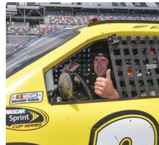
Thumbs up, ready to race on one of the world's most celebrated circuits at Daytona Beach

Back in 1935, the famous British driver Sir Malcom Campbell was the first to break 300 mph on land; now his car, the futuristic Bluebird V , is a highlight of the Motorsports Hall of Fame of America, which opened in 2017 at the Daytona International Speedway. This 2.5-mile concrete oval is home to one of America's top motorsport events, the Daytona 500, where drivers averaging 150 mph speed for about 3½ hours on the steeply-banked track. If you're a real petrolhead, book a NASCAR Racing Experience, which offers several choices. In the three-lap NASCAR Ride Along, you hang on tight and feel the speed while a professional instructor takes the wheel; in the Rookie Experience, first comes instruction, training and a meeting with the crew chief, then you climb in and take the wheel yourself. Eight minutes driving a NASCAR race car – it's pure adrenaline! NASCAR Racing Experience (also at 16 circuits across the USA): www.nascarracingexperience.com ; Daytona Beach: www.daytonabeach.com