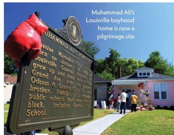
Muhammad Ali's Louisville boyhood home is now a pilgrimage site