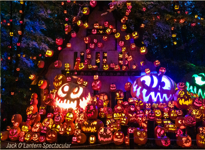
Jack O'Lantern Spectacular