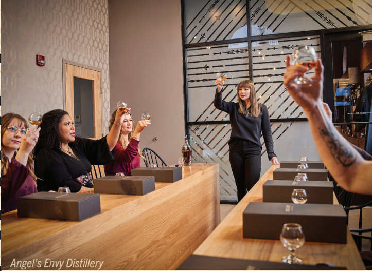
Angel's Envy Distillery