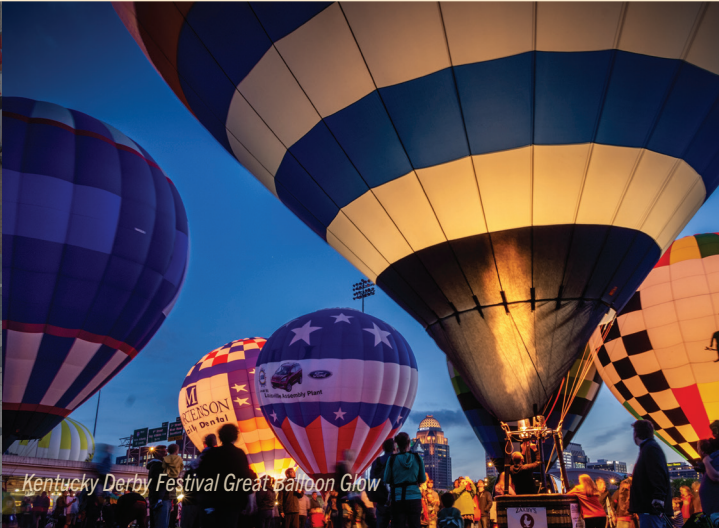
Kentucky Derby Festival Great Balloon Glow

Lights Under Louisville Fête de Noël Gardens Aglitter Historic Old Louisville Holiday Home Tour