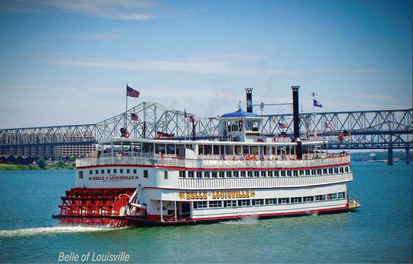
Belle of Louisville

Founded in 1778, Louisville, affectionately known as Bourbon City, boasts a historical legacy reflected in its iconic attractions and unique architecture. With over 120 unique attractions and an award-winning food scene, this vibrant city offers diverse experiences for all visitors. From thrilling horse races and the “Greatest” Muhammad Ali to iconic baseball bats and the art of bourbon making, every visit to Louisville is sure to be unique and memorable.