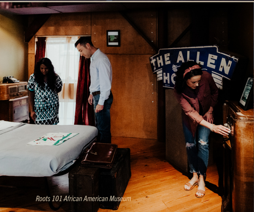
Roots 101 African American Museum