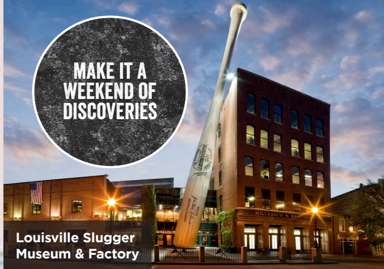
Louisville Slugger Museum & Factory