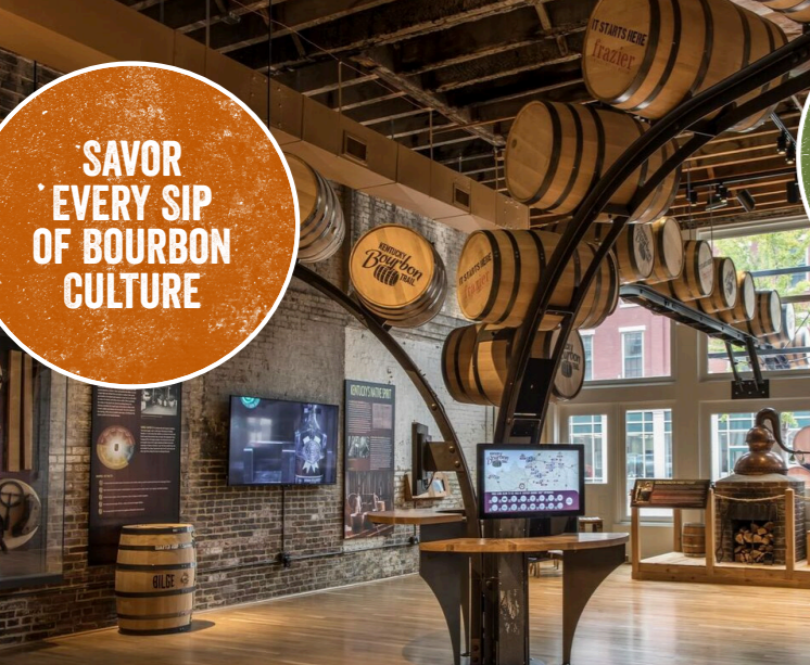
Kentucky Bourbon Trail® Welcome Center at Frazier History Museum