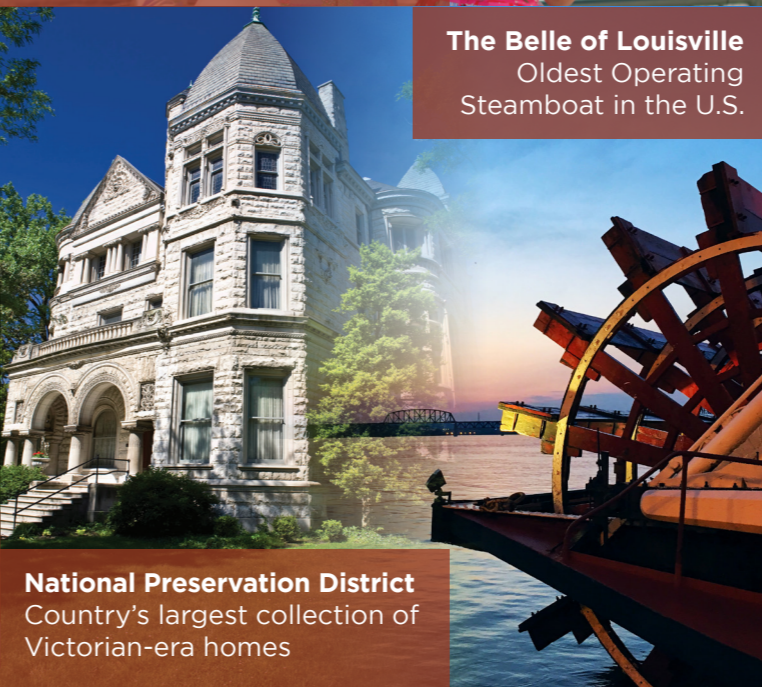
National Preservation District Country's largest collection of Victorian-era homes

LOUISVILLE HAS A FESTIVAL FOR NEARLY EVERYTHING BOURBON | FOOD | MUSIC | ART | AND MORE