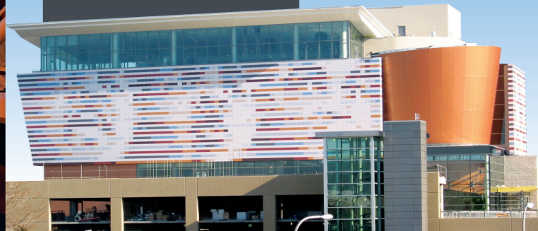
Muhammad Ali Center