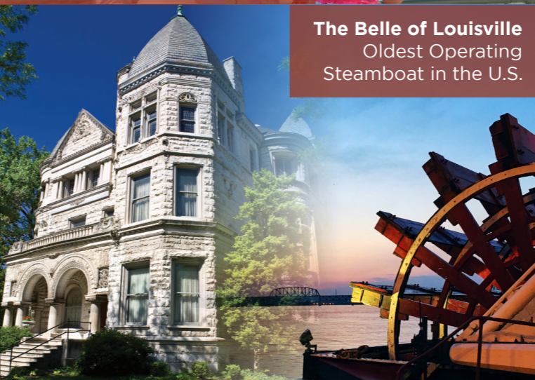
The Belle of Louisville Oldest Operating Steamboat in the U.S.