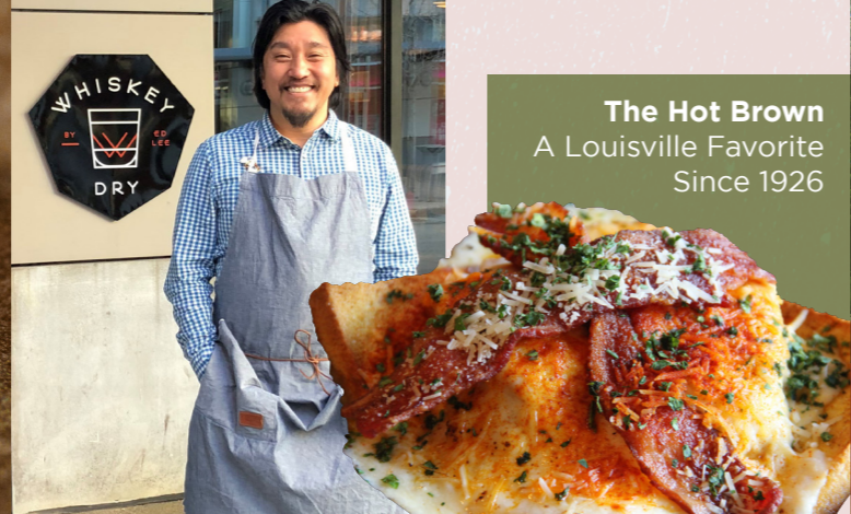
The Hot Brown A Louisville Favorite Since 1926