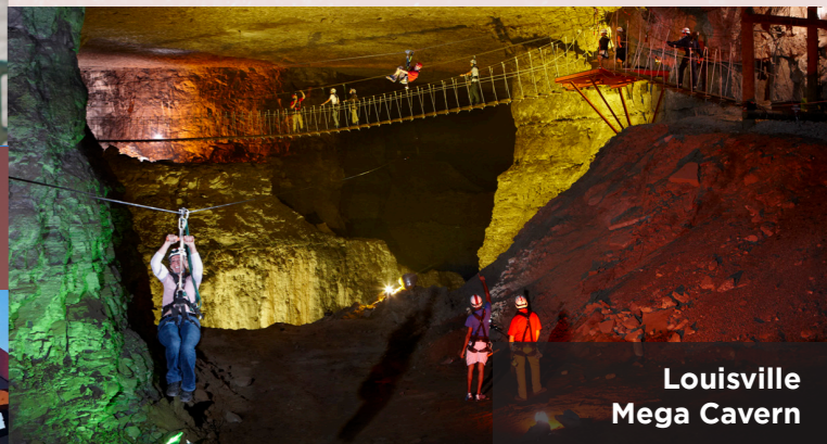
Louisville Mega Cavern